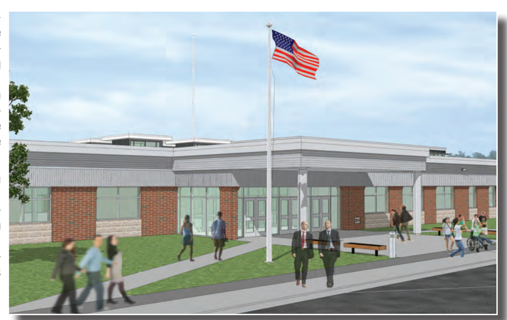
Exterior rendering of the administrative entrance