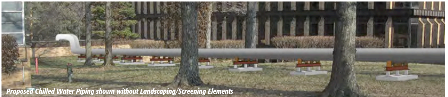
Proposed Chilled Water Piping shown without Landscaping/Screening Elements

EI designed new chilled water piping, connections to the existing Chilled Water Plant and all transition and campus interconnection points, as well as new low-height pipe rack structure to support the above-ground chilled water piping. The design of site restoration, landscaping elements and partial architectural enclosures was also provided to screen the pipe rack structure within the campus setting. The design required extensive site survey, geotechnical and ground penetrating radar (GPR) efforts to accurately locate existing site features, underground utilities and determine the presence of historic fill so that pipe support foundations could be properly located and designed.